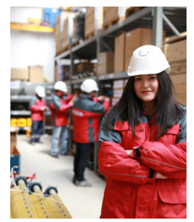
Scenes from MEKA Factories